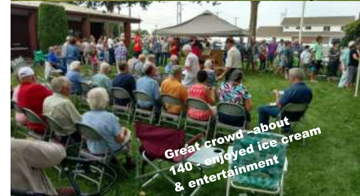
Great crowd - about 140 - enjoyed ice cream & entertainment