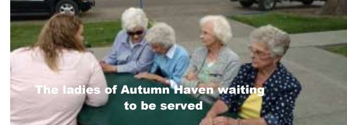
The ladies of Autumn Haven waiting to be served