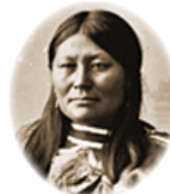
Chipeta (1858-1924 - Indian Rights Advocate and Diplomat Chipeta was a wise and contrary advisor to her husband, a Ute Indian leader. Born into the Koowa Apache tribe in the 1840s. Chipeta was raised by the Uncompahgre Ute tribe in what is now western Colorado. In her teens she wedded Ouray, who became a

This year's theme is: Celebrating Women of Character, Courage, and Commitment. Here are a few of the 2014 Honorees.