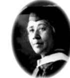
Anna Julia Haywood Cooper (1858-1964) African American Educator and Author

powerful Ute chief during the often violent and brutal times of western settlement. Chipeta was a peacemaker who did not consider all settlers to be the enemy, often giving food to starving white families. Chipeta lived 45 years on a reservation in Utah, lauded as a wise elder and advisor to other Indian chiefs and an honored guest in the homes of settler families.