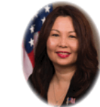
Tammy Duckworth (1968-Present) Member of Congress and Iraq War Veteran

professional to found the non-profit organization. Under her direction, the program offers holistic case management, counseling, educational resources, and job training for victims of abduction and enslavement. In the fall of 2013, Freedom House opened The Nest to serve girls ages 12-17. This new shelter provides a space to help girls to recapture their interrupted youth in a loving family setting.