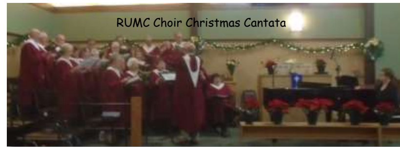
RUMC Choir Christmas Cantata