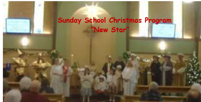
Sunday School Christmas Program "New Star"