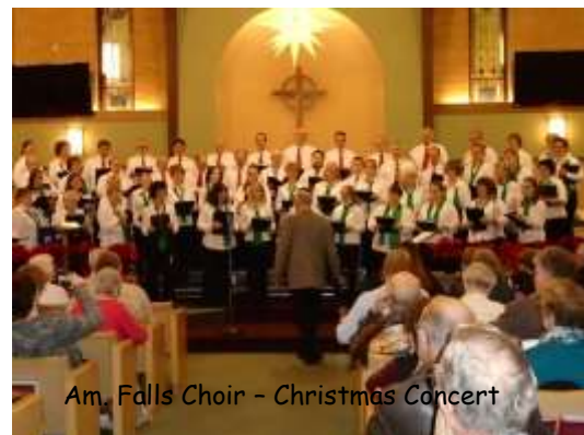
Am. Falls Choir - Christmas Concert