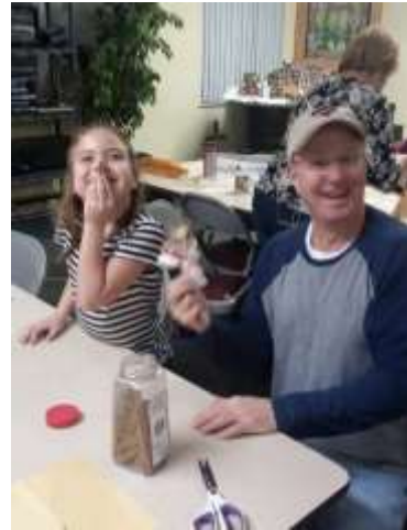
Hanging of the Greens - Advent Party